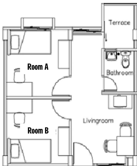
A room suite in SIIT Residence Halls at Bangkadi Living area 35.5 m 2